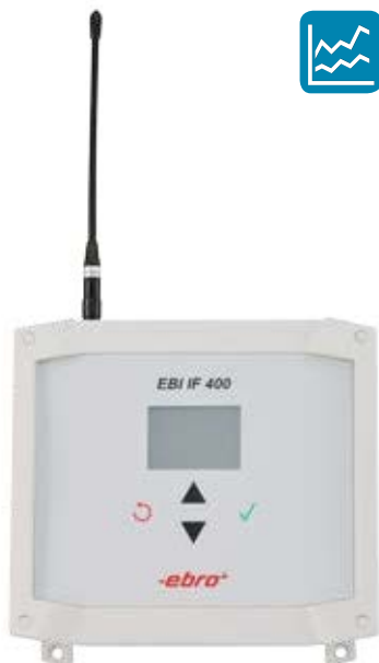
EBI IF 400 Interface including antenna