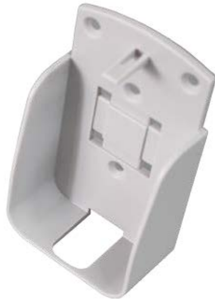
AG 152 Wall mount for EBI 25