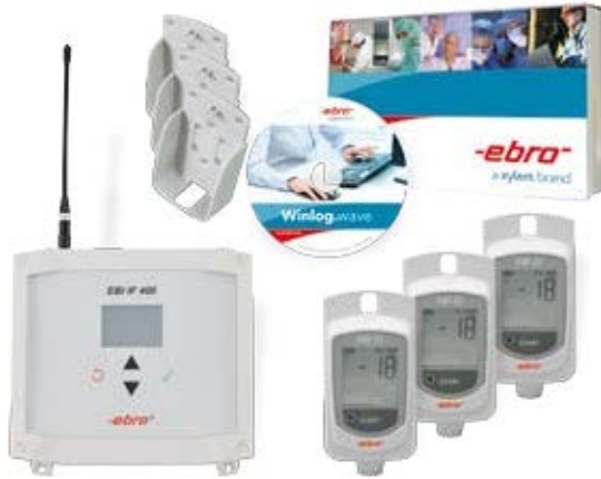
EBI 25-T-SET Wireless temperature logger set (3 EBI 25-T loggers, evaluation software Winlog.wave, interface, 3 wall mounts)

Please find evaluation software for EBI 25 data loggers starting from page 84.