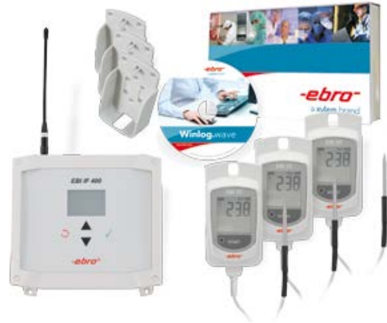
EBI 25-TE-SET Wireless temperature logger set (3 EBI 25-TE loggers, evaluation software Winlog.wave, interface, 3 wall mounts)