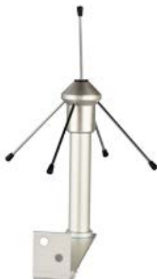
AL 116 external antenna for the interface EBI IF 400 interface for more power, optional