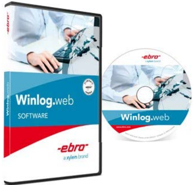
Winlog.web Evaluation software (web-based server version)