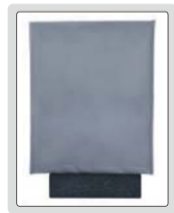
dust cover (included)